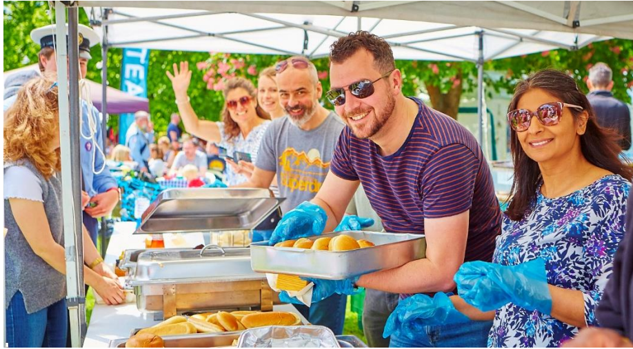
The success of the Esher May Fair relies on the efforts of Ajax parents and supporters