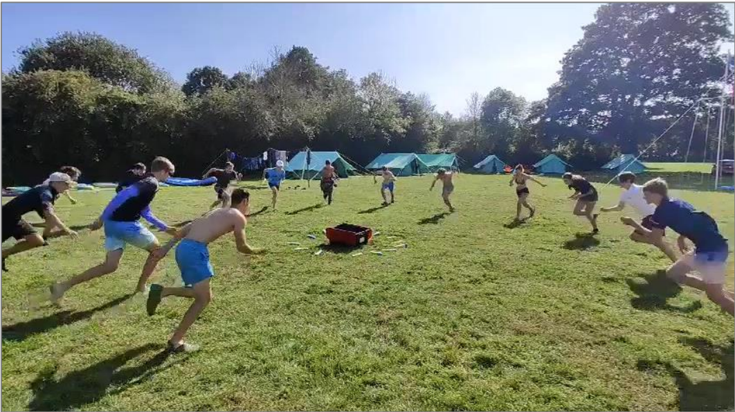
Summer Camp 2023 – Cobnor Point, Chichester Harbour, West Sussex