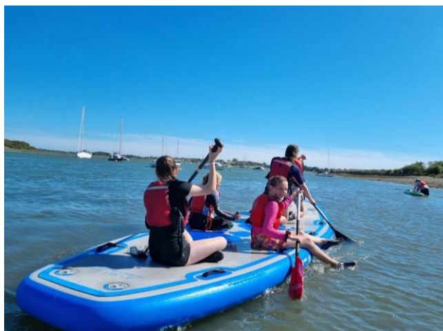
Scouts out for a paddle on Ajax's giant SUP