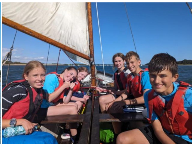
Sailing a gig is way easier than rowing it!