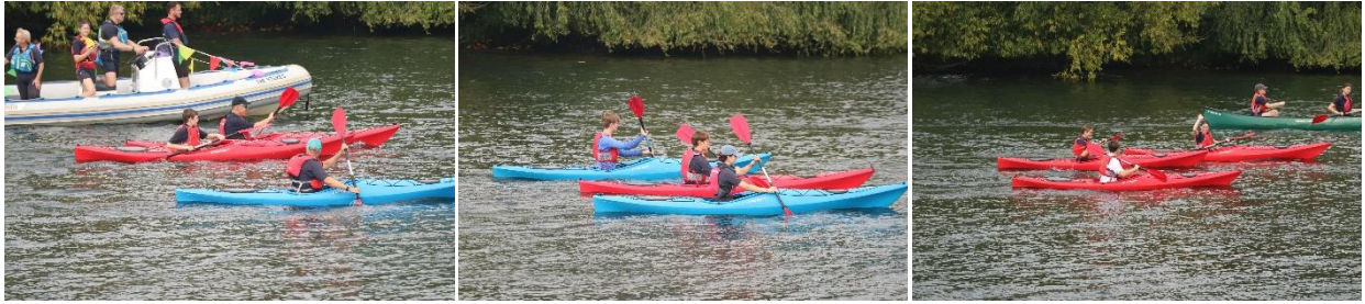
Ajax's fleet of 9 new touring kayaks added colour to the procession of Scout boats and crews marking Ajax's 75th Anniversary celebrations

During 2023, we also acquired one of the original batch of Home Counties gigs commissioned by Scout Groups i.e. a sister vessel to PYMBS. The Group's £5,000 investment covered the cost of acquisition and refurbishment to restore "Hercules" to serviceable condition. Hercules has been in use as a Scout gig on the Thames for over 60 years, and its acquisition will enable the Group to get more of our young people afloat developing key knowledge, skills, confidence and teamwork.