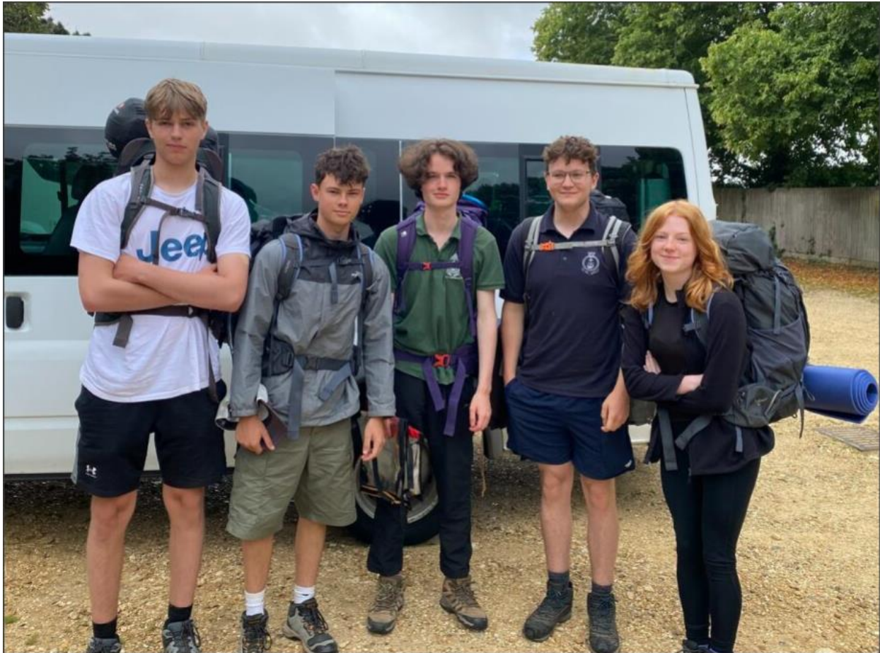
DoE Gold expedition setting off.