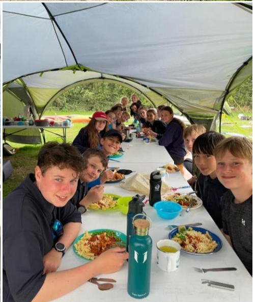
Clockwise from top left: (1) Sailing in a gig is a new experience for many of our Scouts; (2) Chichester Harbour and its surroundings is a designated area of outstanding natural beauty, a major wildlife haven, and perfect to explore on a day hike; (3) All the Scout patrols shared a central mess tent at this year's Summer Camp; and (4) Learning to sail a Pico sailing dinghy is fun !

We held our camp this year in an area of outstanding natural beauty and it was stunning. Even the weather was with us, most of the time anyway. The Scouts enjoyed a very special camp where, for the first time, they had the opportunity to drive a power boat and to sail one of our traditional Home Counties Gigs, Norge. The camp offered many opportunities to sail with our Picos and Wayfarers in addition to the Gig. The packed programme also included kayaking in our new touring kayaks, messing about on the giant SUP as well as our normal SUPs, hiking and staying away overnight. A full-on week was experienced by all including all the leaders!